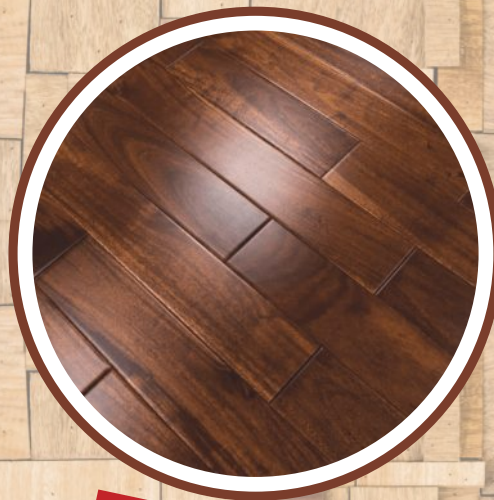
• DECORATIVE FLOORINGS