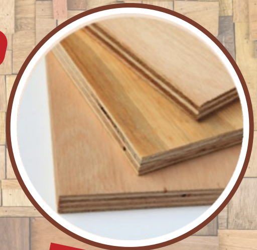
• DENSIFIED PLYWOOD